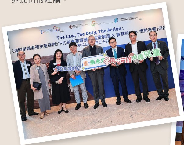
重量級嘉賓應邀出席研討會，全力支持。 Distinguished guests attended the Forum in full support.

The Mandatory Reporting of Child Abuse Ordinance (the Ordinance) will take effect on January 20, 2026, covering 25 professional groups across social welfare, education, and healthcare. As a non-governmental organization in Hong Kong providing the largest number of Small Group Home service for children, our multi-professional team includes a significant ratio that 34% of capacity are registered professionals. From the drafting stage, the Home set up a task force internally and, together with sector partners, collected and submitted views on the Bill to the Legislative Council. In early 2024, the Home organized a Forum to gather frontline feedback and submitted farther recommendations to the legislature. Through continued follow-up and advocacy, we are pleased to see many proposed ideas reflected in the final ordinance.