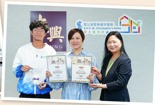
同心支持 Together we support!