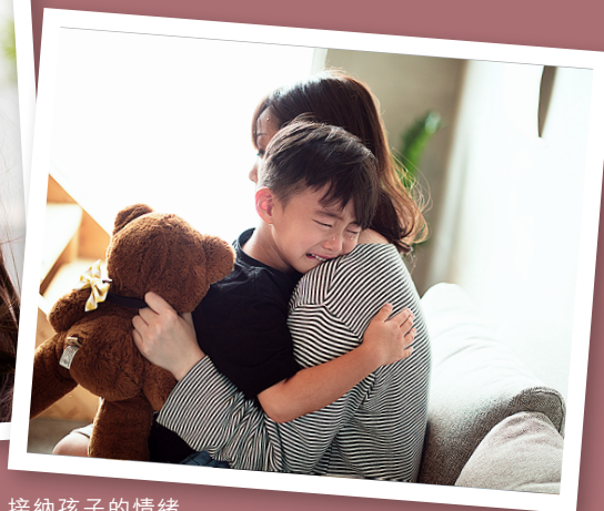
接納孩子的情緒 Accept children's emotions