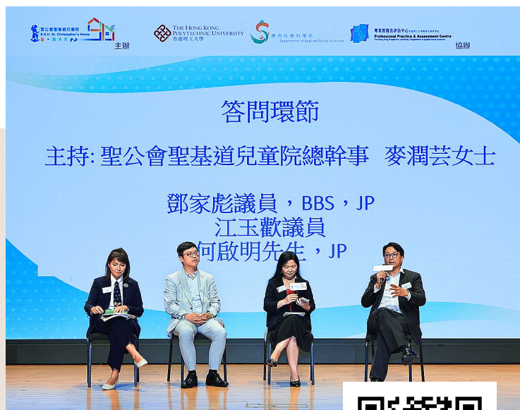
台上熱烈討論 Keen discussion in the Forum