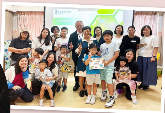
與童同行 Let's walk with kids!