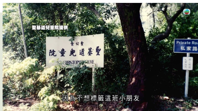
昔日聖基道 The Home's old site

The program aired on TVB Jade in August, offering the public a deeper look at Home's 90 years of service in Hong Kong.