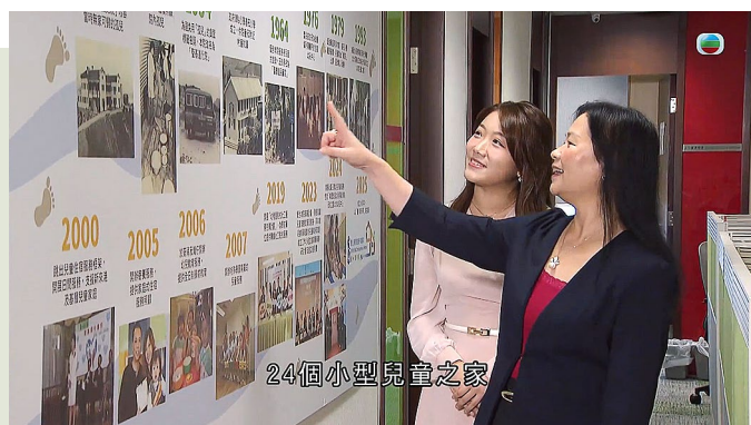
回顧本院發展 Review the Home's development