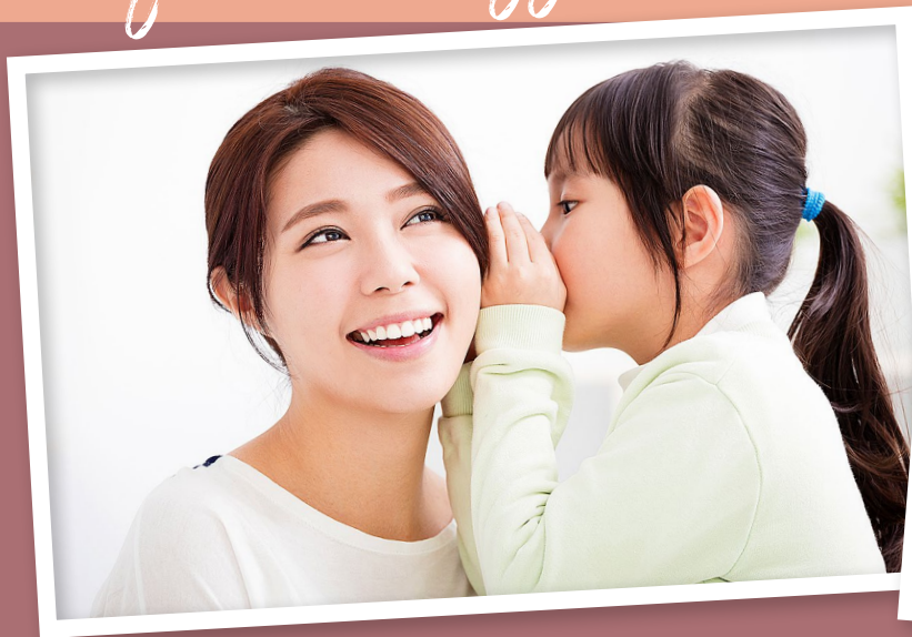
聆聽孩子 Listen to your child