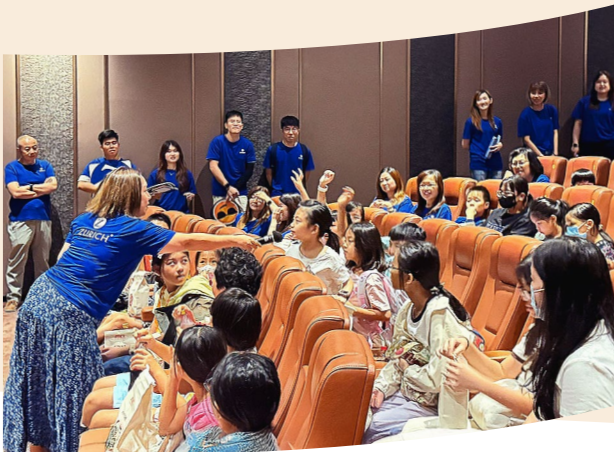
反應熱烈 Enthusiastic response