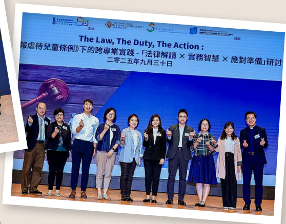
研討會獲跨界別代表參與 Cross-sector representatives supported the Forum

2025年9月30日，聖基道再次聯同香港理工大學應用社會科學系專業實務及評估中心舉辦〔The Law, The Duty, The Action: 《強制舉報虐待兒童條例》下的跨專業實踐 - 「法律解讀 × 實務智慧 × 應對準備」研討會〕，內容涵蓋立法初心、條例解讀、強制舉報者指南、跨界實務分享、機構風險應對及真實個案分享，協助各界為條例實施做好準備。聖基道在報名期間向逾千名參加者進行問卷調查，結果顯示七成人回覆自評對條例認識不足，突顯培訓與支援的迫切性。