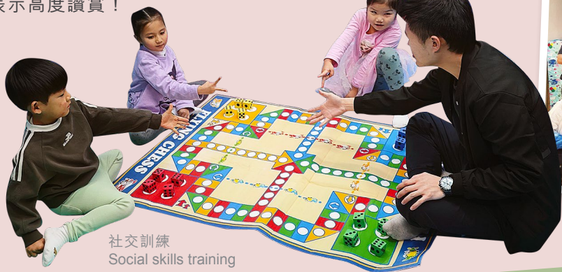
社交訓練 Social skills training