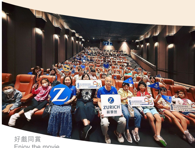
好戲同賞 Enjoy the movie

This summer, around 130 children from Small Group Homes and Heart Link enjoyed a movie screening of "Elio", with drinks, snacks and souvenirs sponsored by Zurich Insurance (Hong Kong). Nearly 30 corporate volunteers attended to host a fun quiz game with the children. They ended the day with laughter and joyful memories together.