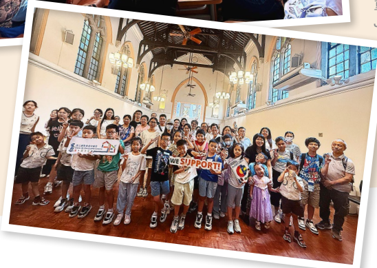
童樂同樂 Joy for all