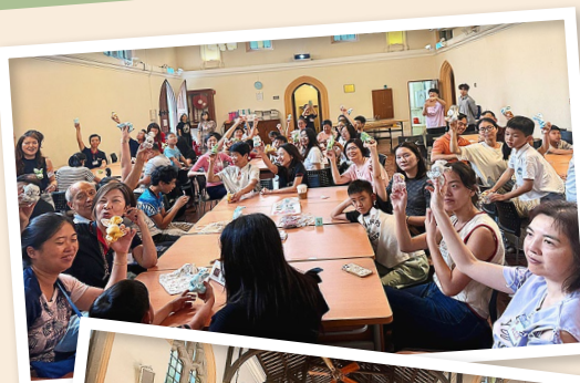
齊做手工 Fun craftwork

With support from members of St. John's Cathedral, Heart Link hosted a Joy for All Fun Day at the church. Activities included towel-bunny crafts, storytelling, interactive games, gift delivery, and a treasure hunt exploring this 170-year-old declared monument's history, stories and architecture. 43 children from low-income families and their caregivers enjoyed a joyful, enriching weekend with the church members.